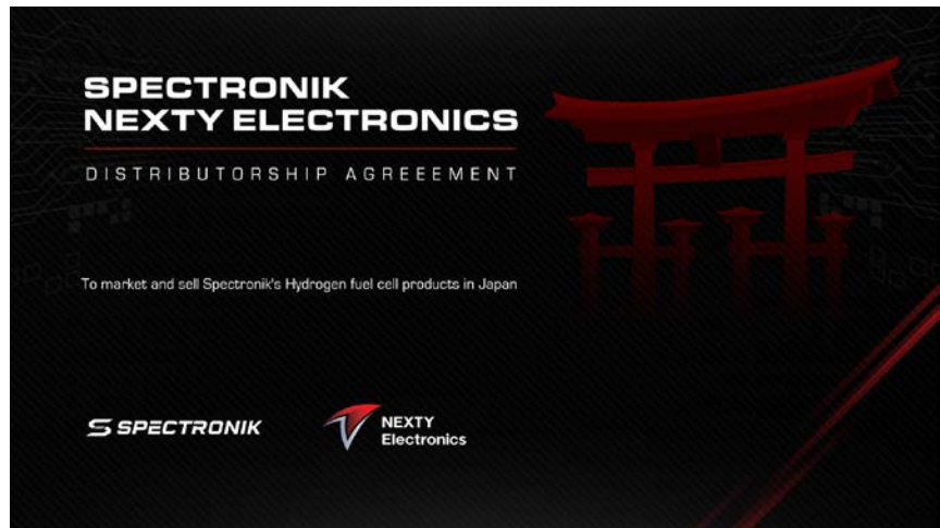
Fig 1. NEXTY Electronics – Spectronik Distributorship Agreement announcement poster